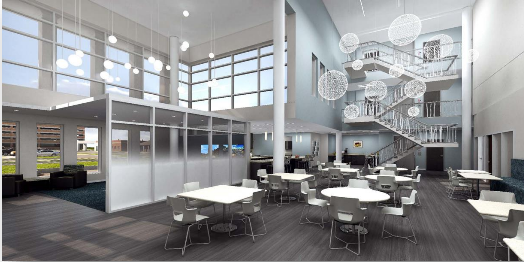
The 3-story Family Dining Room will serve as the heart of the House. Families will bond over meals, share cups of coffee, updates on their child, and sometimes a bowl of ice cream late at night.